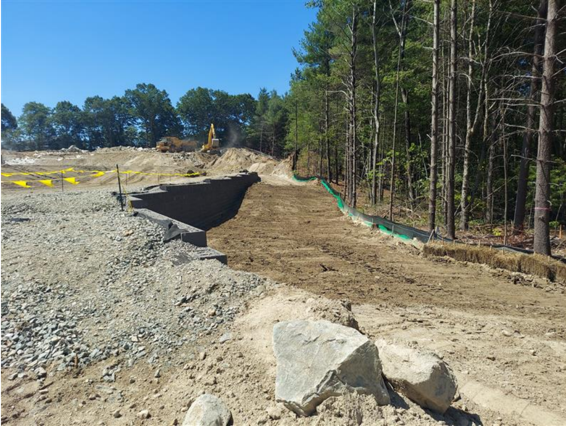
Photo 2: In progress view of retaining wall installation at a development site